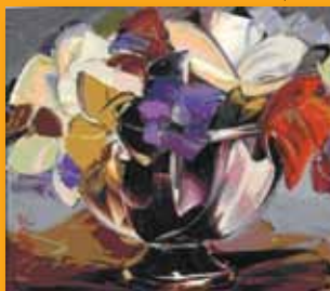
Floral studies, palette knife, oil on canvas. www.royalene.co.za