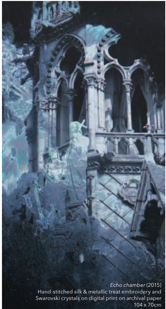
Echo chamber (2015) Hand-stitched silk & metallic thread embroidery and Swarovski crystals on digital print on archival paper 104 x 70cm