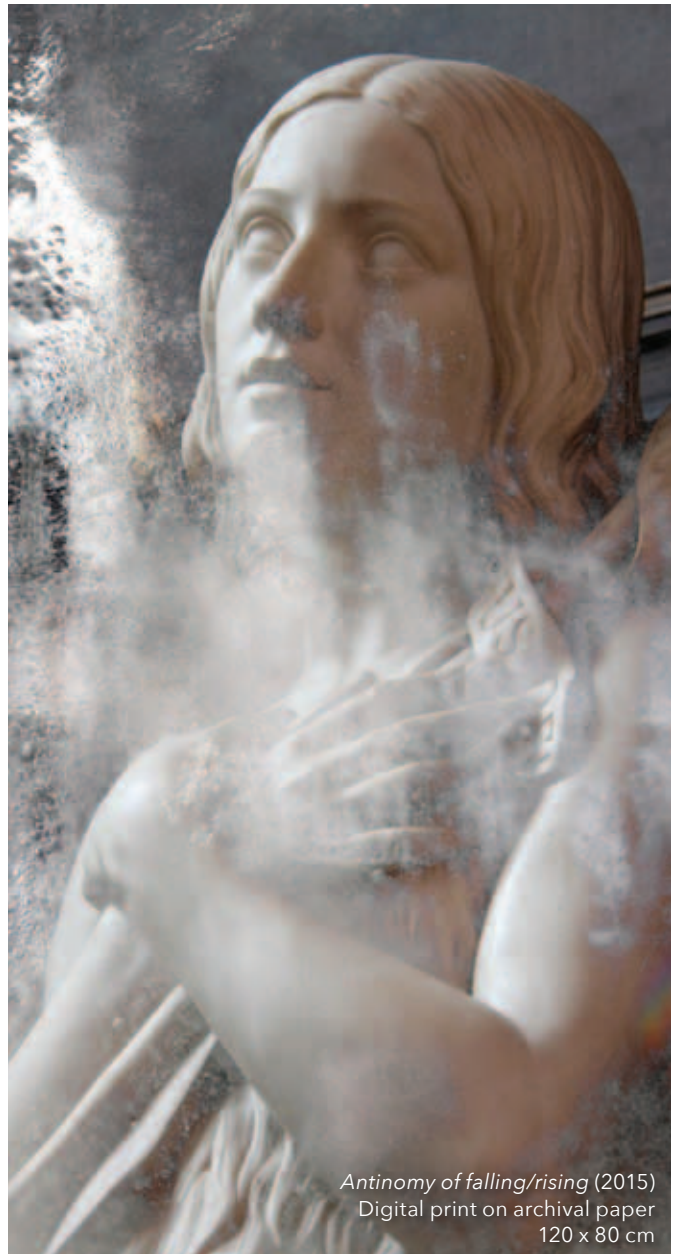
Antinomy of falling/rising (2015) Digital print on archival paper 120 x 80 cm