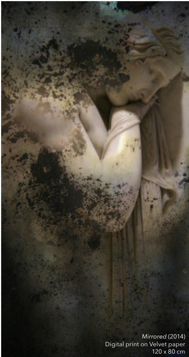
Mirrored (2014) Digital print on Velvet paper 120 x 80 cm